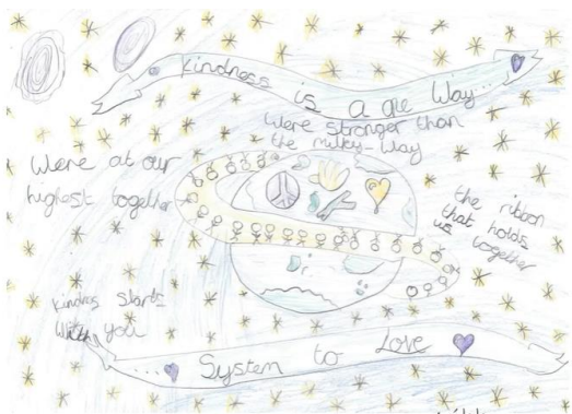
- Libby (Y4/EDB)