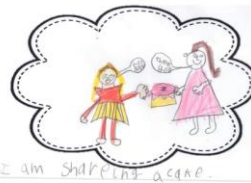
"I am sharing a cake." - Isla (Y2/G)