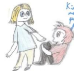
"Kindness helps people when they fall down."