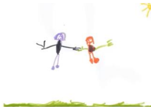
"I'm going to share my toys with Mummy. Mummy loves purple." - Olivia (Y1/MW)