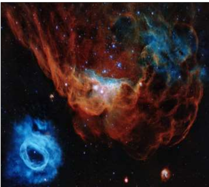
Pictured: The anniversary image, taken from Hubbles Twitter page, featuring the giant nebula NGC 2014 and its neighbour NGC 2020, part of a vast star-forming region in the Large Magellanic Cloud.

The Hubble telescope celebrated 30 years since it was launched by releasing an amazing image, the picture of nebulas NGC 2014 and NGC 2020 has been nicknamed the "Cosmic Reef" because it looks like an undersea world. Nebulas NGC 2014 and NGC 2020 are part of the Large Magellanic Cloud, a satellite galaxy of the Milky Way, around 163,000 light-years away. The giant telescope was sent into low Earth orbit in April 1990 to capture images and data of distant galaxies, planets and supermassive black holes, deep within our universe. The information gathered has been used to write thousands of scientific papers. You can see what the Hubble telescope saw on your birthday by adding your birth month and day at https://imagine.gsfc.nasa.gov/hst_bday/ you will then be shown the best photo captured on that date within the last three decades!